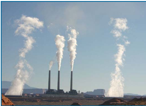
Coal-fired Power Plant

lease of stored energy from the sun. Today, we have developed a variety of systems to use biomass for energy, such as woodstoves, pellet stoves and even converting biomass to ethanol to fuel vehicles.